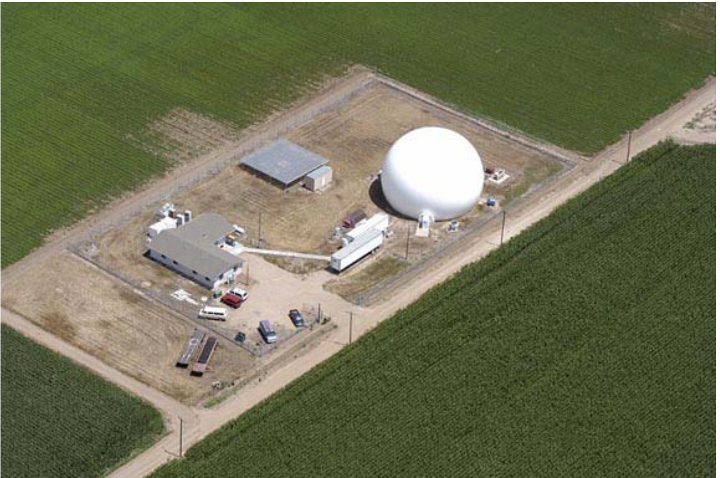
CSU-CHILL facility